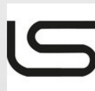
LASTRADA FASHION NY LLC (US)