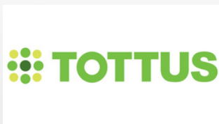
TOTTUS (Chile & Peru)